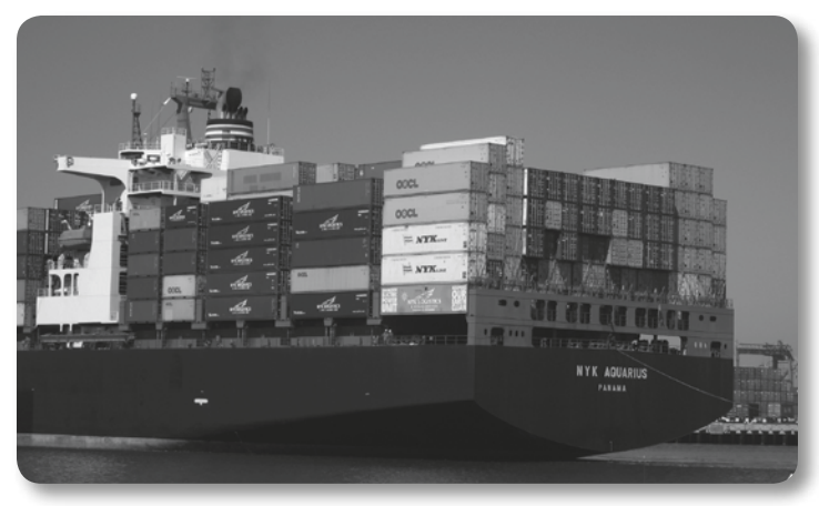
Large container ships emit thousands of tons of air pollutants off the coast of Santa Barbara County every year.

For more information, see www.OurAir.org/itg/shipemissions.htm.