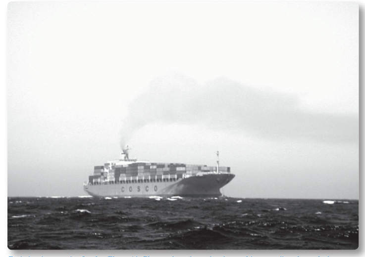
Emission inventories for the Clean Air Plan update show that large ships traveling through the Santa Barbara Channel may be producing even more air pollution than was previously calculated. APCD is working on cooperative efforts to reduce these emissions. For more information, see www. sbcapcd.org/itg/shipemissions.htm