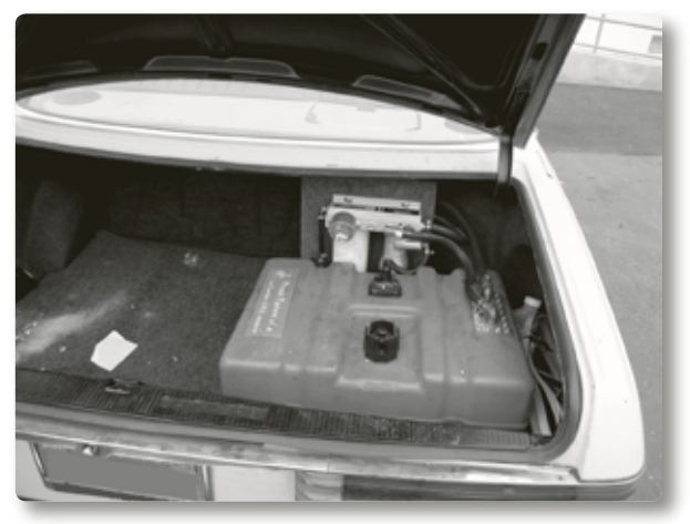
Oil storage tank.

For more information, click on "air purifiers" from our home page at www.OurAir.org, or call us at 961-8800.