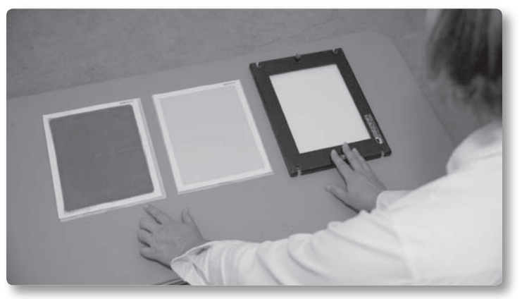
The dark colored particulate filter from the Las Flores Canyon monitoring station, located in a canyon area near El Capitan, shows the high level of particles in the surrounding air from midnight October 21 to midnight of October 22. The other two filters are a filter from the same monitoring station exposed from midnight October 3 to midnight October 4, and an unexposed filter.

To find out more about AB 32, and all of ARB's programs, visit http://www.arb.ca.gov.