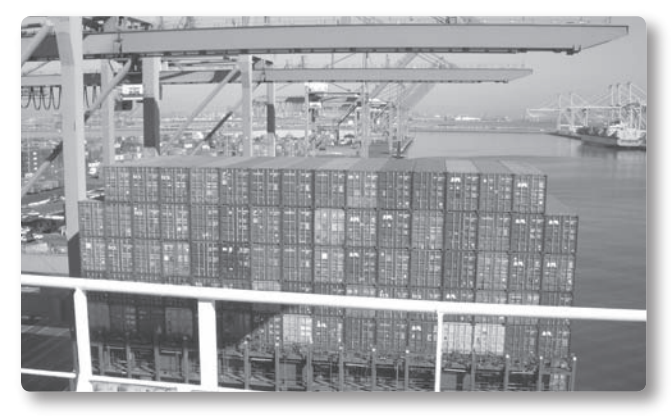
View from the bridge of the APL SINGAPORE, as cargo is loaded.

In October, Murphy and other APCD staff visited the APL SINGAPORE at dock at the Port of Los Angeles to view the testing setup. The vessel had just returned from its voyage across the Pacific. On this voyage, an emissions testing crew studied the