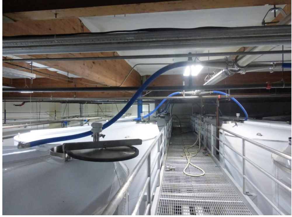
Closed top fermentation tanks with EcoPAS piping manifold