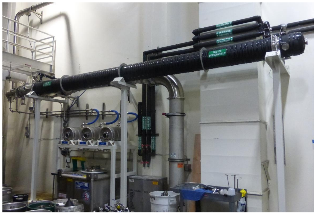
EcoPAS control system