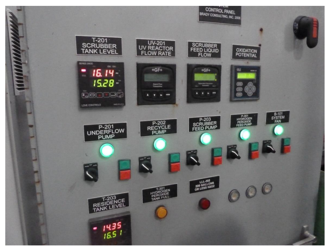
Packed bed scrubber control panel