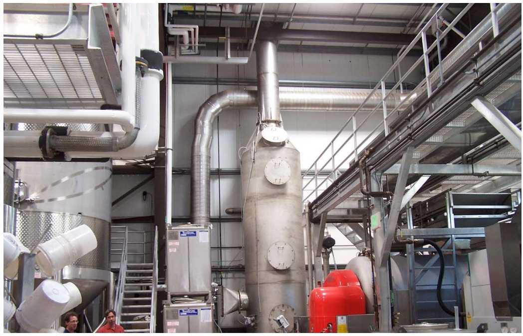
Packed bed scrubber