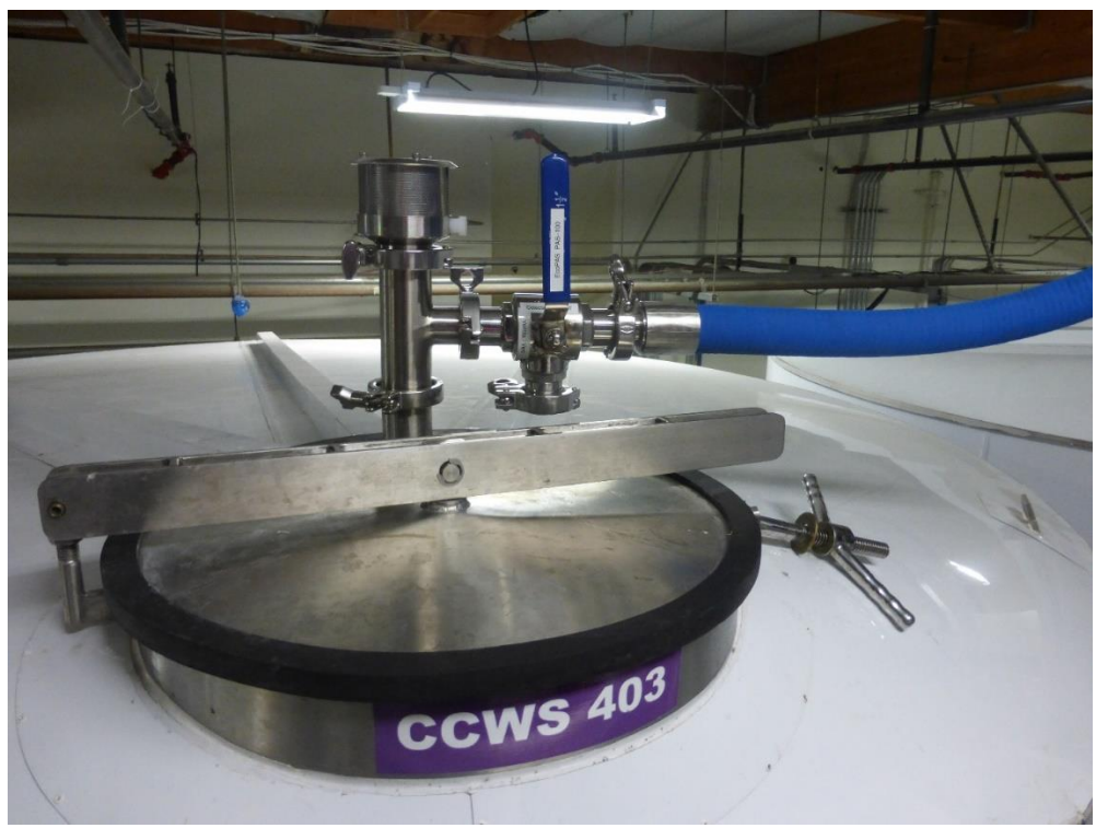
Closed top fermentation tank with EcoPAS piping