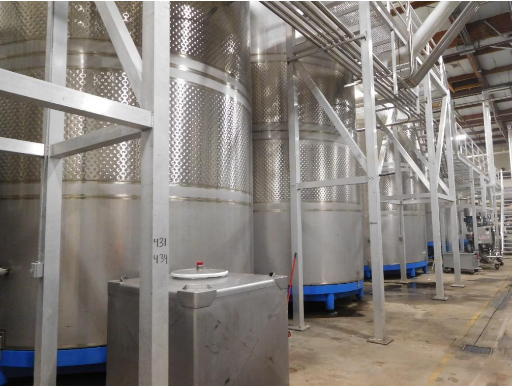
CCWS Series 400 tanks and EcoPAS piping manifold