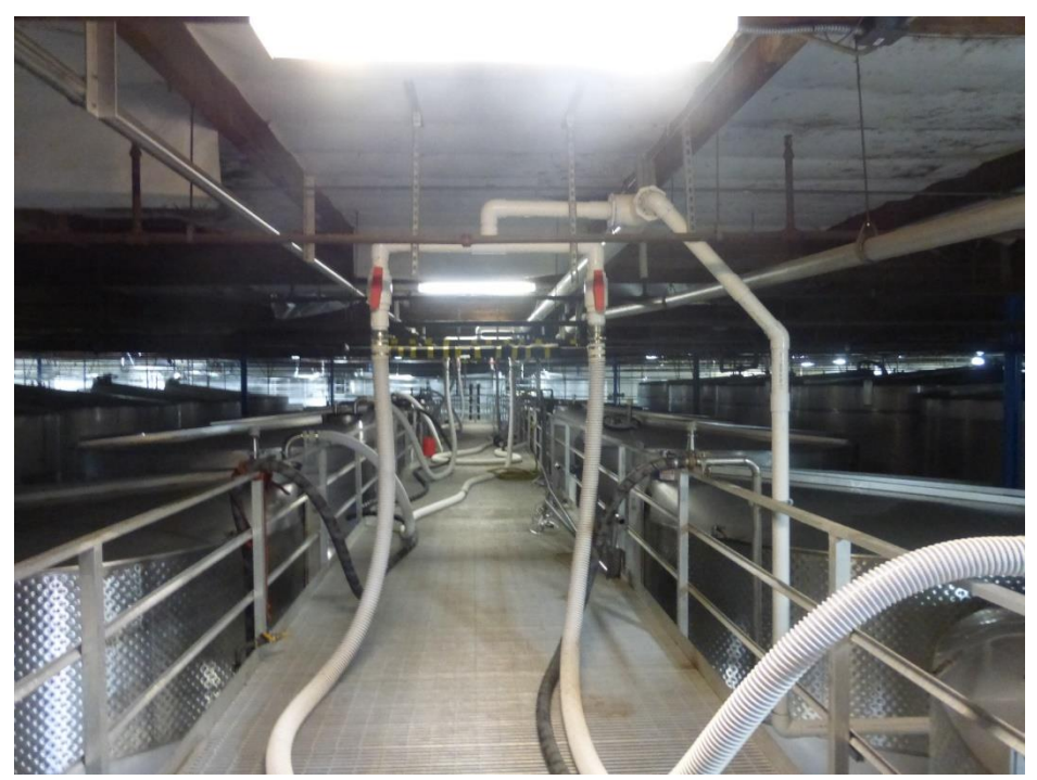
Closed top fermentation tanks with NoMoVo piping manifold