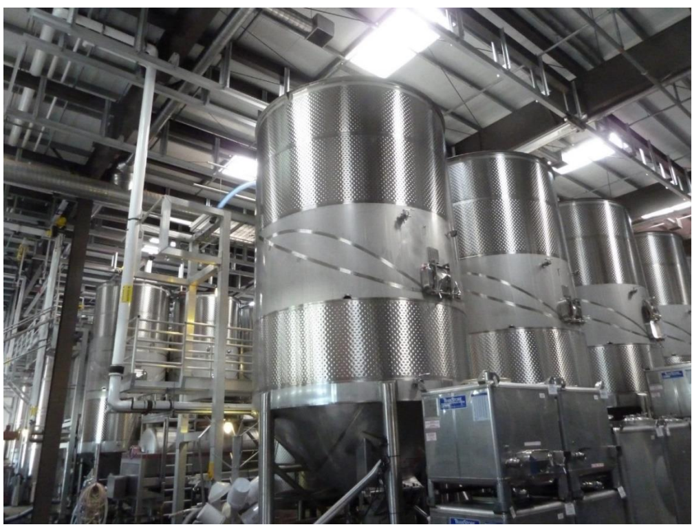
Wine fermentation tanks and fermentation room ventilation ducting