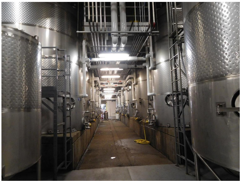
CCWS Series 400 tanks and EcoPAS piping manifold