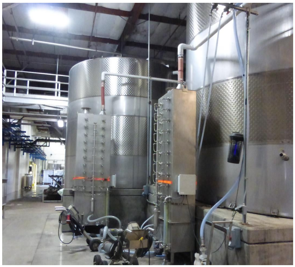
Attachment 3 – NoMoVo Pictures