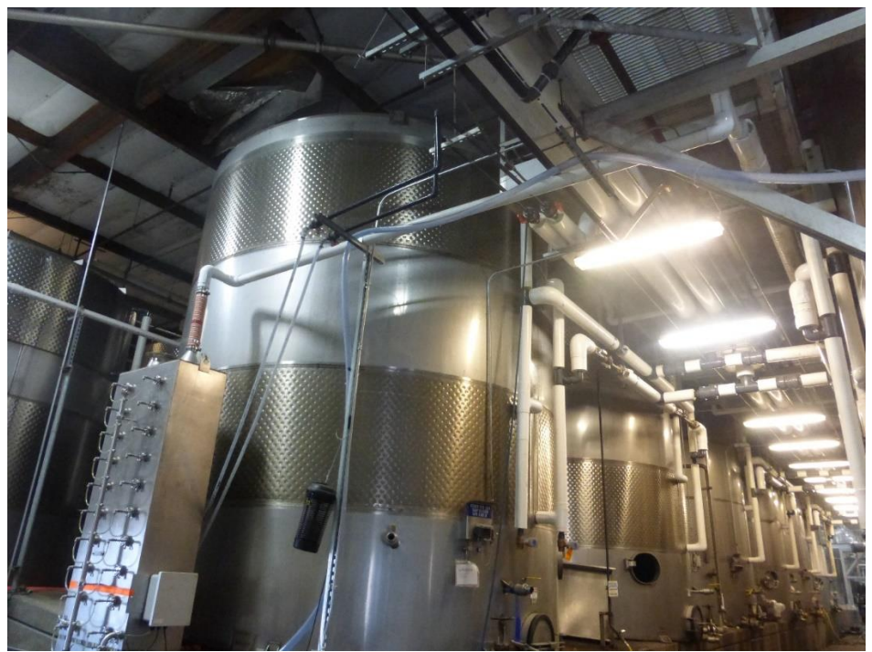
NoMoVo control system with NoMoVo piping manifold