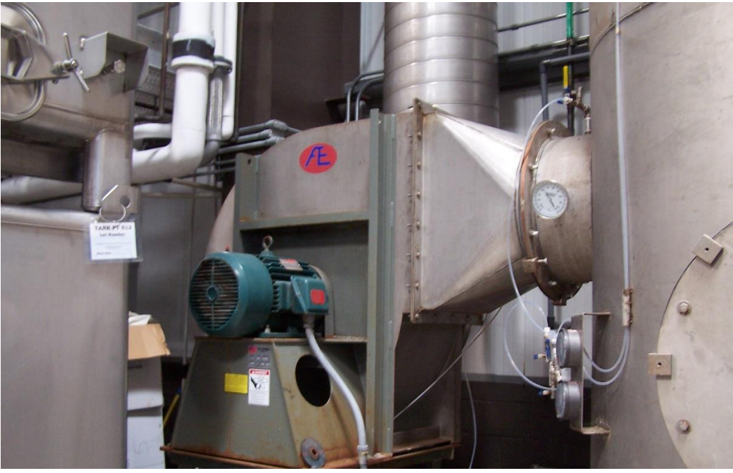
Attachment 1 – Terravant Packed Bed Scrubber Pictures