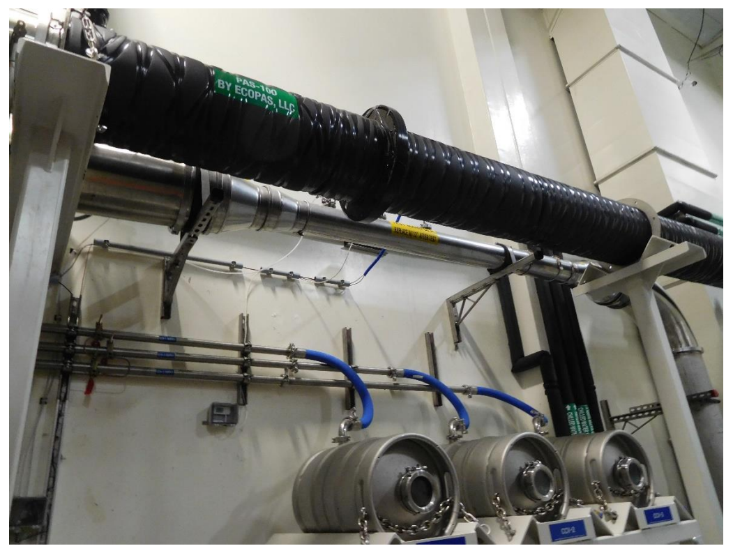
EcoPAS control system and condensate storage tanks