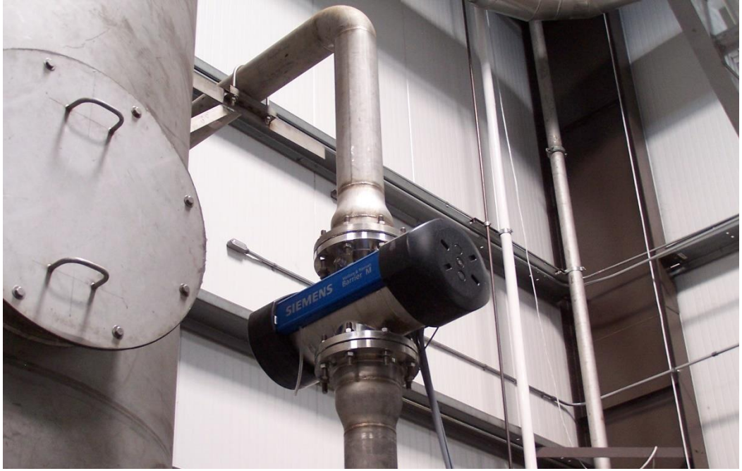
Packed bed scrubber and UV treatment lamp