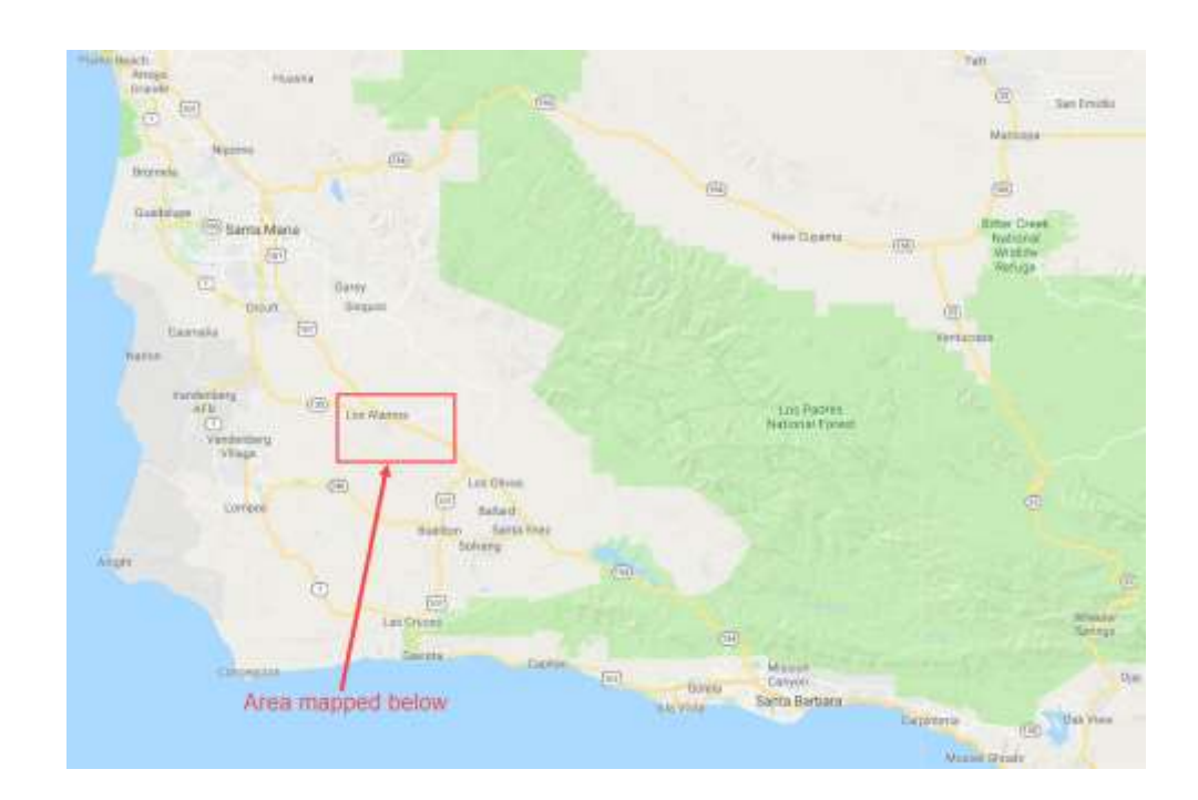
Figure 1.1 - Location Map for the Blair/Barham-Boyne Leases