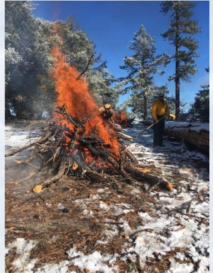
Figueroa Mountain Prescribed Burn 2018