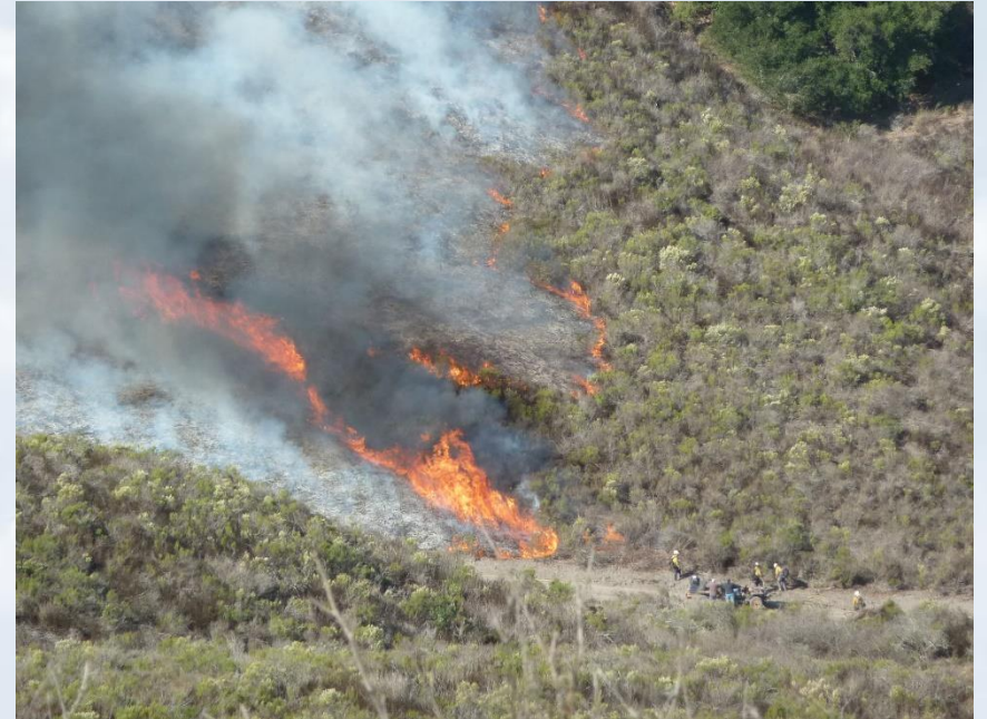
Righetti Ranch Prescribed Burn 2018