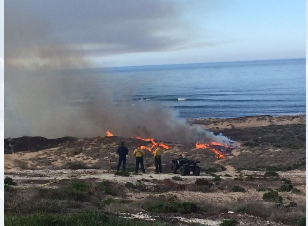
VAFB Prescribed Burn 2017