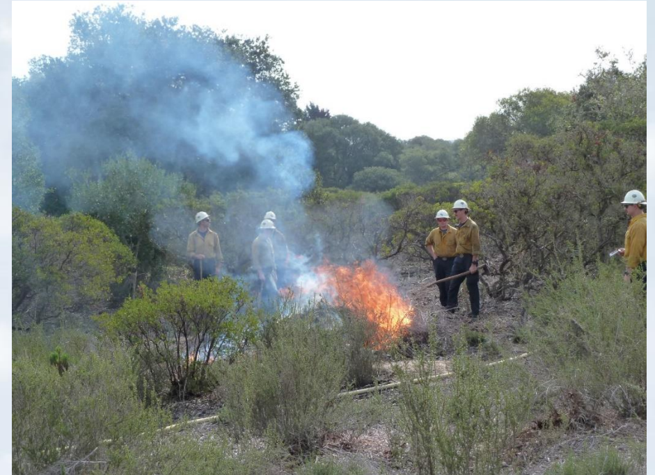
Burton Mesa Prescribed Burn 2019