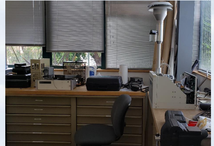
District Monitoring Lab